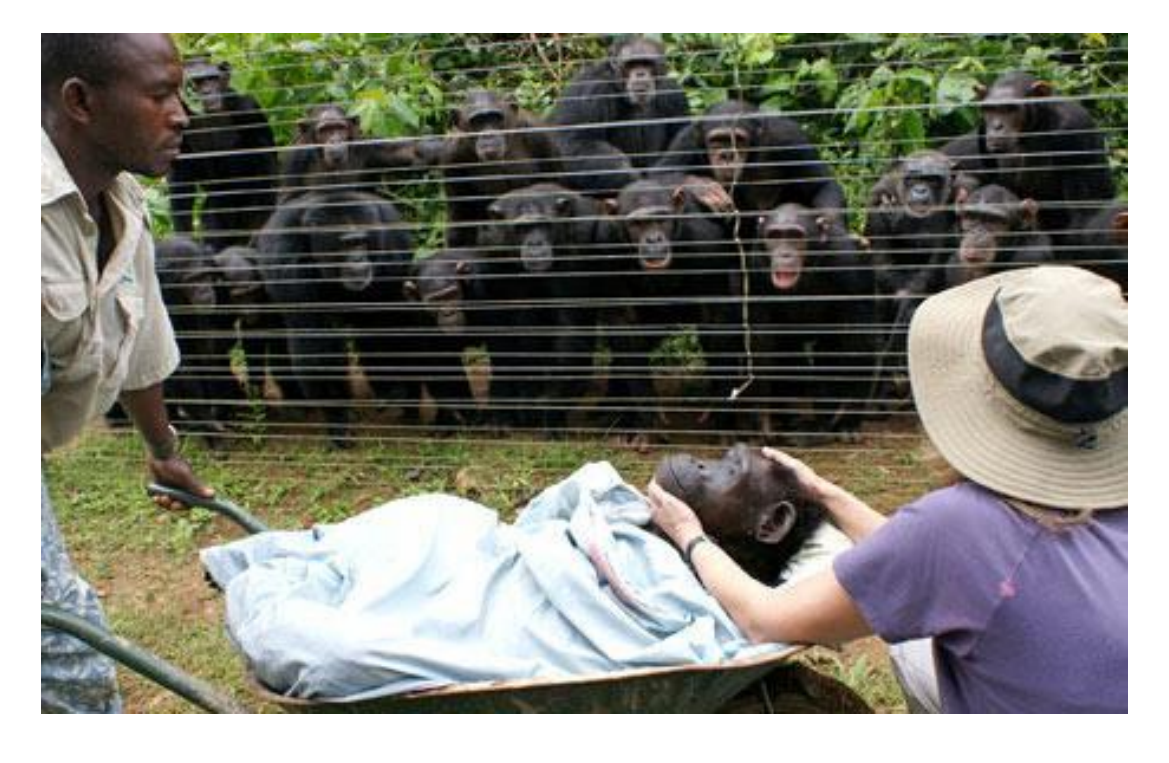
A group of chimpanzees have been photographed seemingly grieving for the death of one of their own in Cameroon.