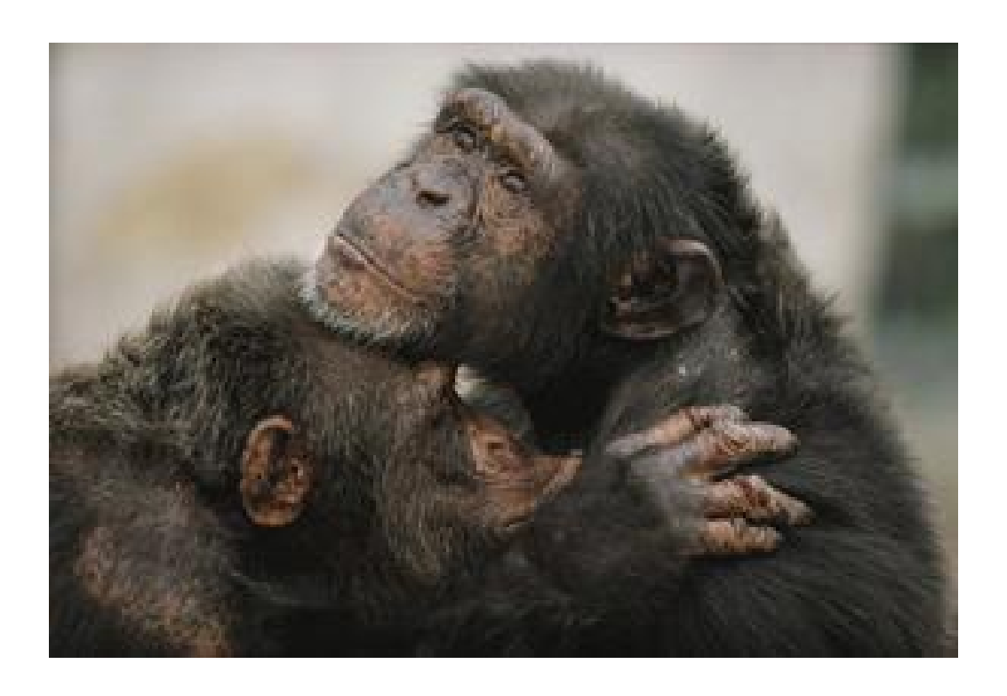
Monkeys like human, they are strongly oriented to the need for passion and love.

Another study looked at altruism in chimps - and found they were often willing to help others even when there was no obvious reward. "Chimpanzees spontaneously help both humans and each other in carefully controlled tests" said de Waal.