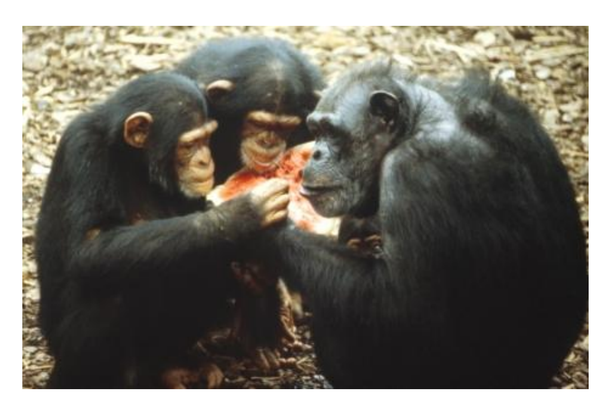
A female chimp shares a watermelon with two juveniles, one of which is her offspring.