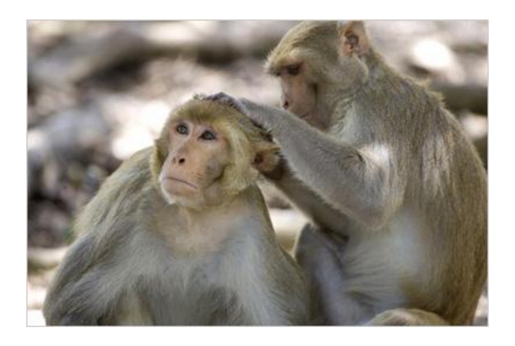
An obvious example for cooperation between monkeys and each others

The new research illustrates that moralities is not only a human characteristic but also monkeys have moralities! The genes in these creatures are designed to guide them to the right way. Allah says on the tongue of prophet Hud: (I put my trust in Allah, my Lord and your Lord! There is not a moving (living) creature but He has the grasp of its forelock. Verily, my Lord is on the Straight Path (the truth).) (Sûrat Hûd-verse56).