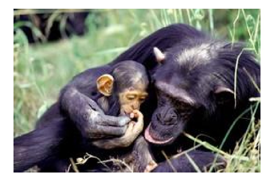
Monkeys have feelings like human, what we see in the above picture is a monkey holds his or her young to fill that baby with love and passion.

This verse was descended 1400 years ago at a time when no one had got the knowledge that animals, insects and birds have communities like human as there were many myths about those creatures.