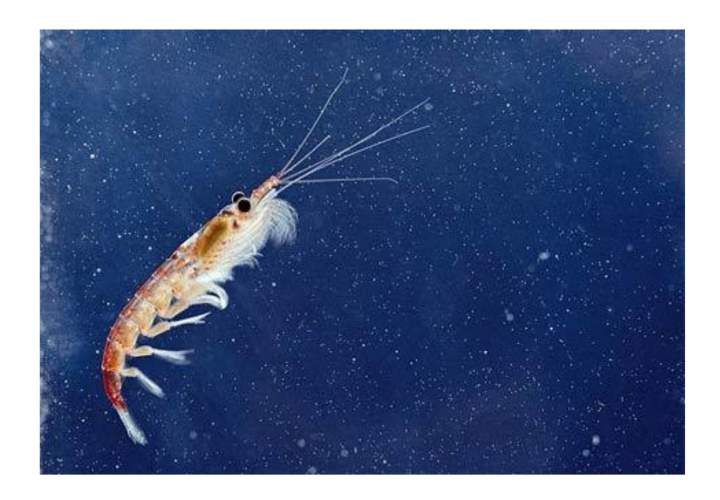
Integral to the food chain, tiny shrimp krill are the primary food source for many marine mammals and fish such as the blue whale.

Blue whales look blue underwater, but on the surface their coloring is more a mottled blue-gray. Their underbellies take on a yellowish hue from the millions of microorganisms that take up residence in their skin.