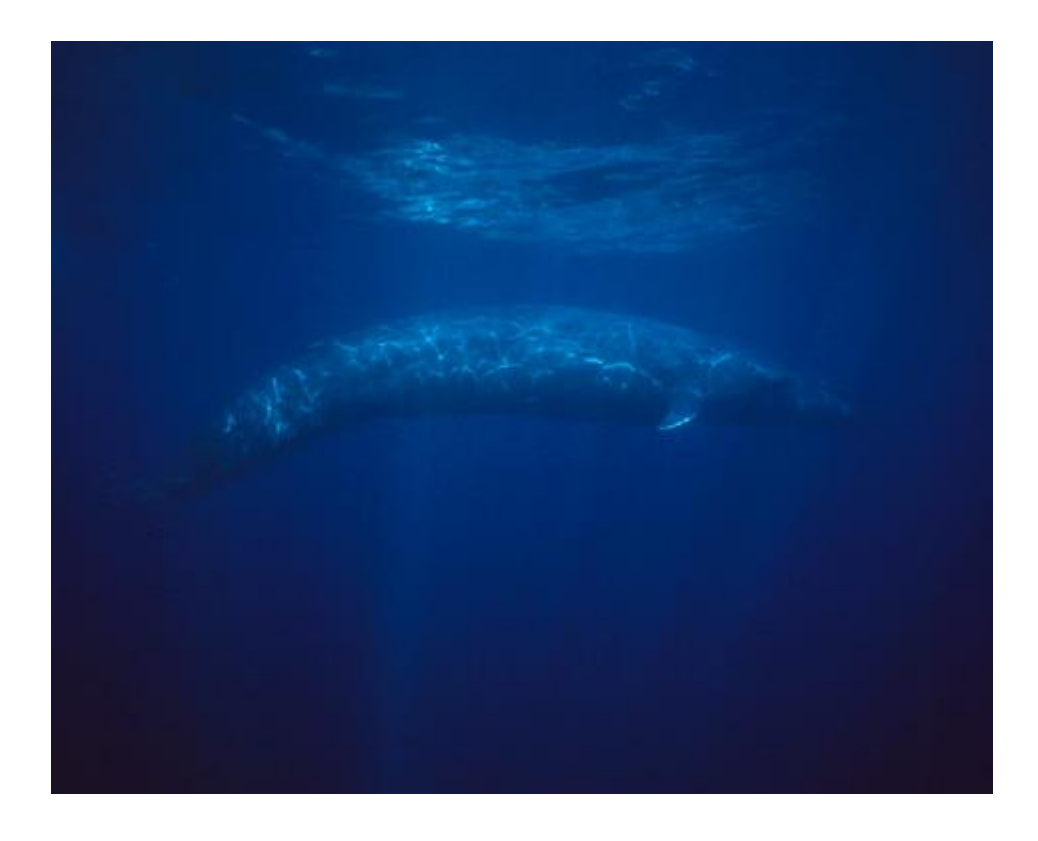
The blue whale has a broad, flat head and a long, tapered body that ends in wide

Blue whales look blue underwater, but on the surface their coloring is more a mottled blue-gray. Their underbellies take on a yellowish hue from the millions of microorganisms that take up residence in their skin.