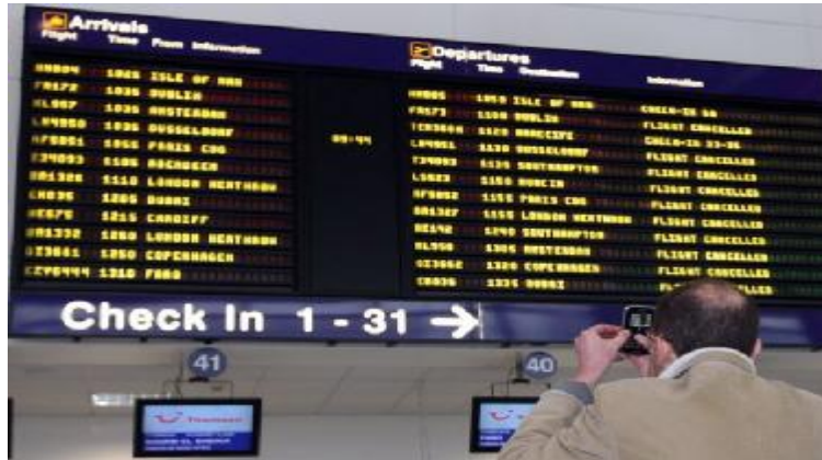
A passenger is taking a picture of a departures board showing canceled flights at Newcastle International Airport, England

Authorities evacuated hundreds of people and all flight traffic in Europe had stopped for days and thousands of passengers stuck at airports. Observers said that the situation was like a full Paralysis in the whole continent.