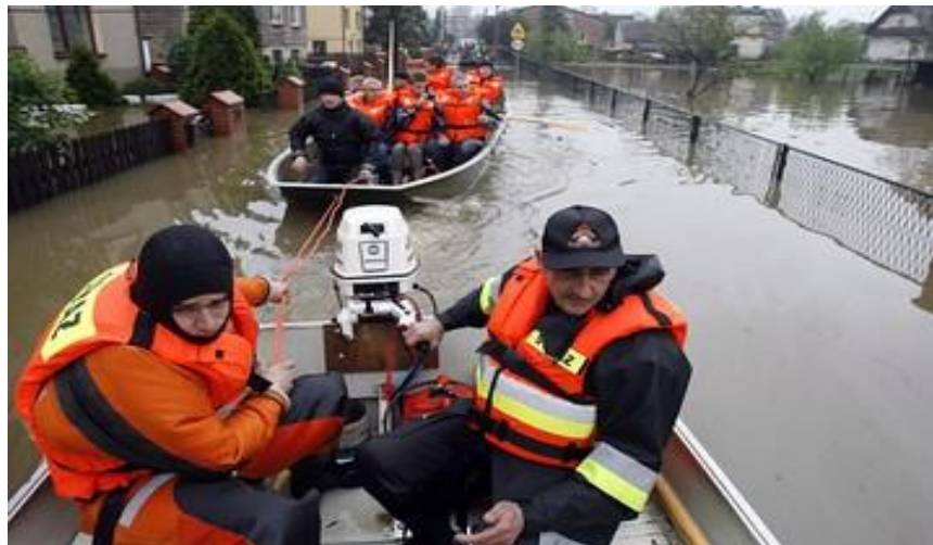
Floods Turned Towns into Lakes

Many have been stranded in their homes in villages near Sandomierz, with water five to six meters deep. They are unable to call for help as power outages have made phone communication impossible in some areas. Poland asked the EU for financial help to cope with damage caused by the floods. To be eligible for assistance from the so-called EU Solidarity Fund, the damage must exceed €2 billion.