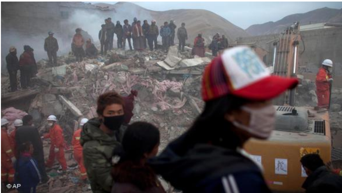
Rescue operations were working hard to save lives of buried people under the debris.

A destructive earthquake hit the country, it was 7.1 Richter. The devastation was astonishing, Over 600 people have been reported dead, and hundreds were injured.