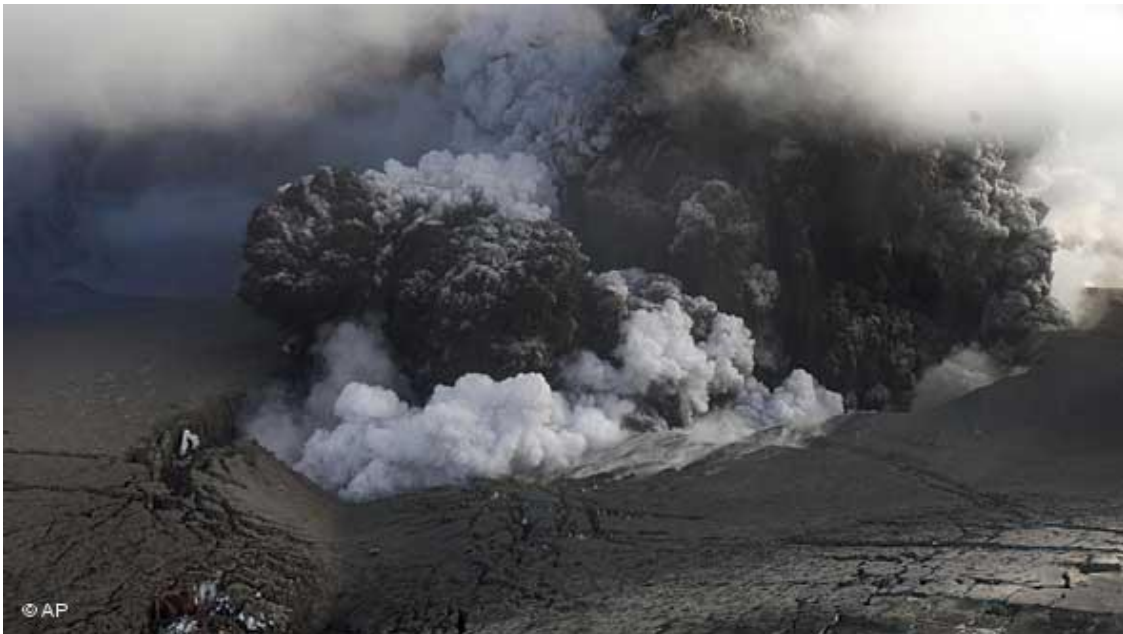
The heavy smoke which erupted from the volcano stopped all air traffic in Europe.

Authorities evacuated hundreds of people and all flight traffic in Europe had stopped for days and thousands of passengers stuck at airports. Observers said that the situation was like a full Paralysis in the whole continent.