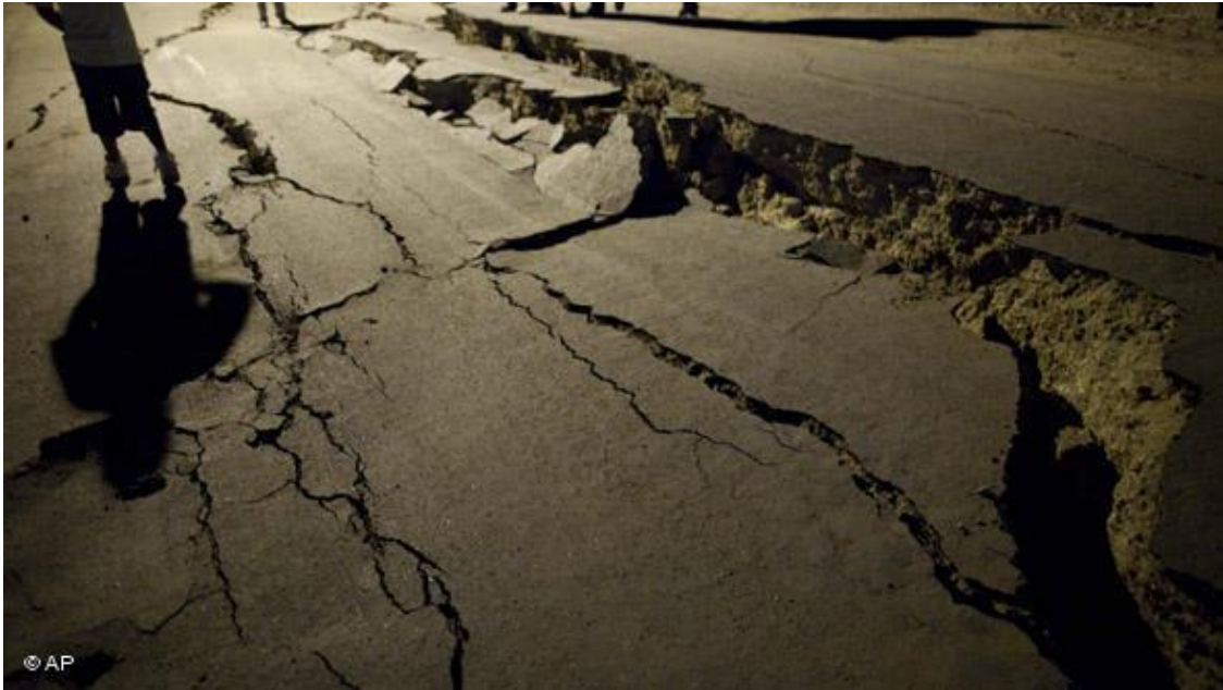
Streets became not suitable for use anymore because of the quake

Another earthquake hit Mexico on April 4, 2010. the earthquake was triggered by the same processes that drive temblors on the San Andreas Fault, which runs all the way from Southern California to north of San Francisco.