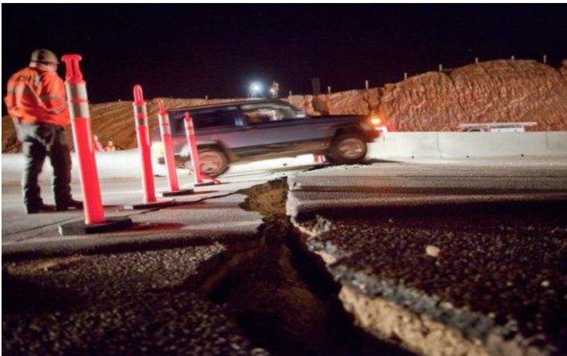
A car passes over a crack in a Mexican highway after the quake