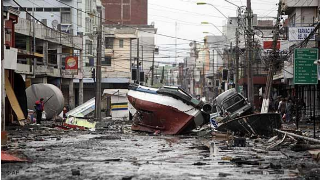
A boat in the middle of a street in Talca city