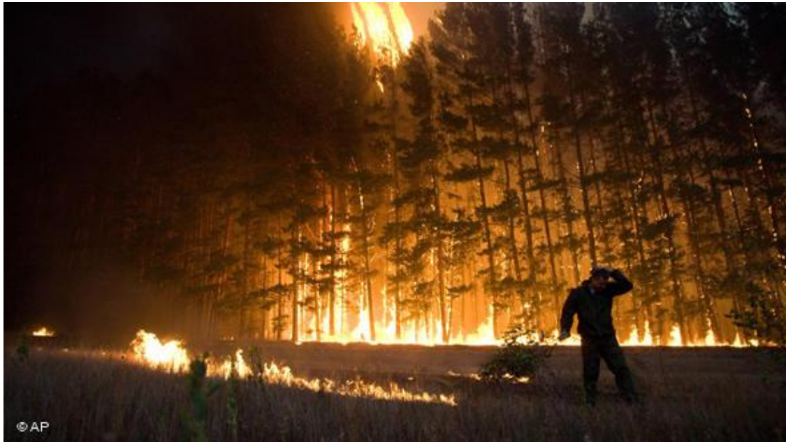
A Russian fireman trying to stop the fire in the Russian forests

failures caused by the Russian drought. The fires have cost an estimated more than $15 billion USD in damages.